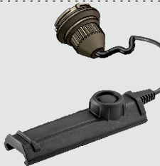
MSW2, Connector for remote switch control