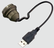
MUSB2, Connector for battery charging