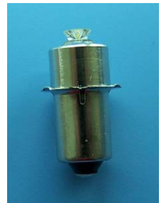
Side emitting LED bulb