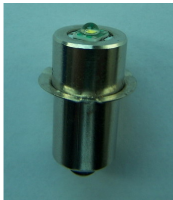
Cree LED bulb