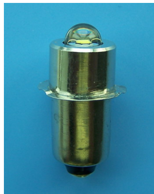
Luxion LED bulb