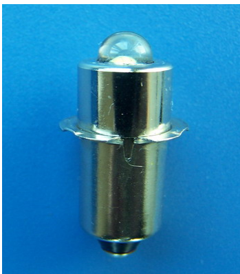
Chinese LED bulb