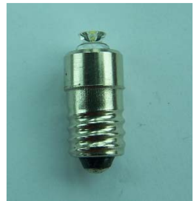
Side emitting LED bulb