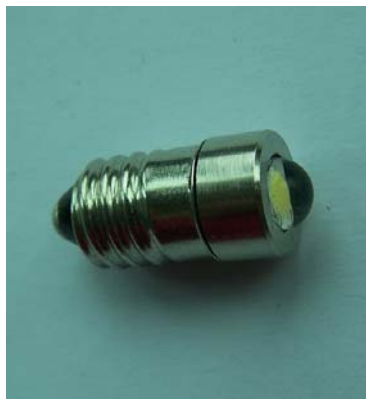
Luxeon LED bulb