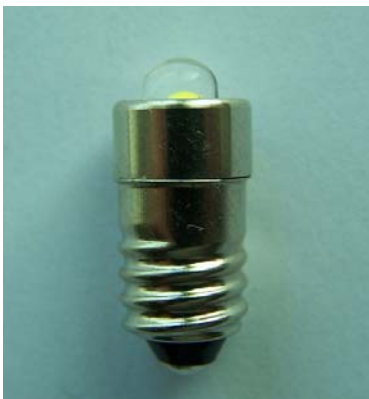
Chinese LED bulb